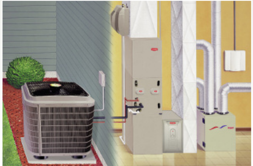
Heat Pump and Fan Coil System